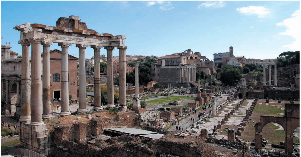
Fori Imperiali, Rome